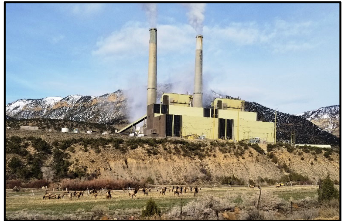
Huntington Power Plant

Salt River Materials Group (SRMG) has been awarded a Fly Ash Marketing Agreement by PacifiCorp for its Huntington power plant, located near Huntington, Utah. This vital, long-term agreement provides SRMG with exclusive rights to market ASTM C618 Class “F” Fly Ash produced at the plant.