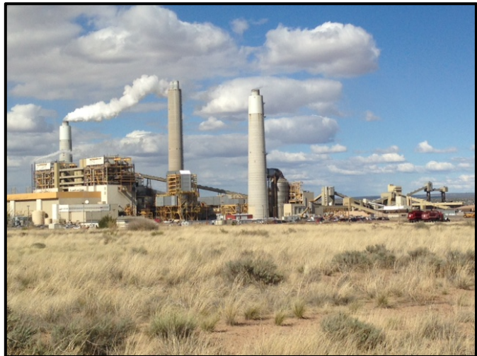
Coronado Generating Station, St. Johns AZ

After a nearly year-long bidding process, Salt River Project (SRP) awarded Salt River Materials Group (SRMG) the Ash Marketing Agreement for its Coronado Generating Station (CGS.) This important, long-term agreement provides SRMG with exclusive rights to market 180,000 tons of total ash (fly ash and bottom ash) produced annually at CGS.